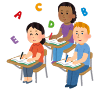
Table1: Difficulty of learning languages from the perspective of native English speakers